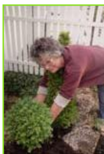
Helga bedding down